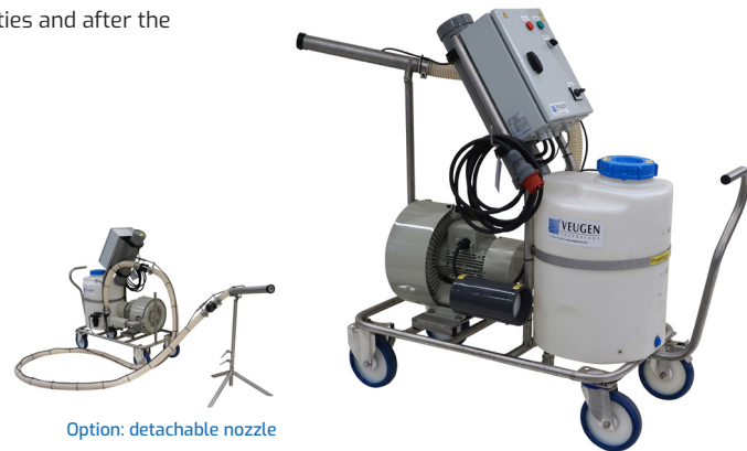
Option: detachable nozzle

The Powerfogger P60 is now also available with removable spray head (can also be placed on stand) and with extended hose. This makes the unit even easier to position outside the area to be treated.