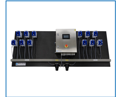
CFU MULTIPLE ROOMS