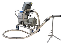
Option: detachable nozzle